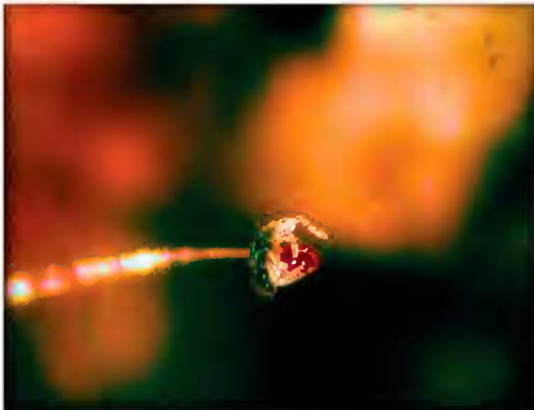
Figure 7: Juvenile springtail sticks to the glue-free snap-tentacle head of Drosera miniata in spite of the use of its furcula to escape.